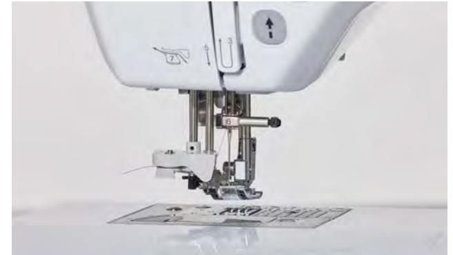
Advanced needle threader