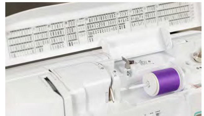
241 built-in sewing and decorative stitches