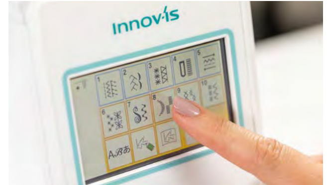
Colour LCD touchscreen