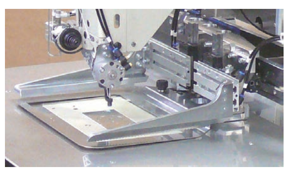
Reliable clamping system