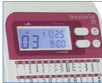
A clear LCD display showing important sewing information.