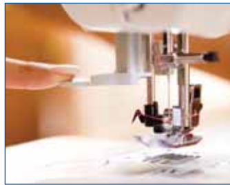
Easy Automatic needle threading