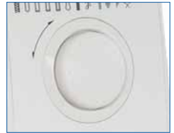
Electronic jog dial makes stitch selection quick and simple.