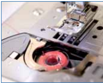
Quick set bobbin. Just drop in a full bobbin and you are ready to sew.