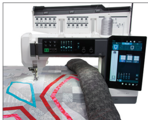
850 Built-in Stitches & 1,250 Built-in Designs