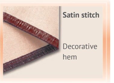
Satin stitch Decorative hem