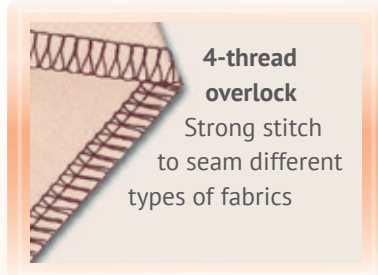
4-thread overlock Strong stitch to seam different types of fabrics