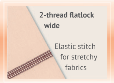
2-thread flatlock wide Elastic stitch for stretchy fabrics