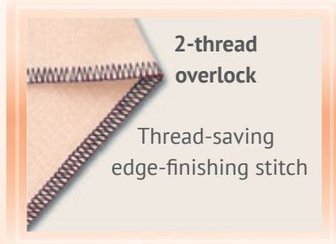
2-thread overlock Thread-saving edge-finishing stitch