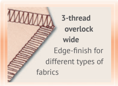
3-thread overlock wide Edge-finish for different types of fabrics