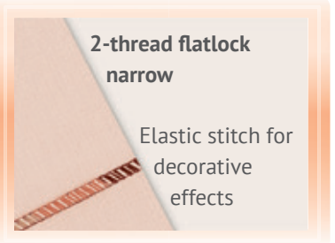
2-thread flatlock narrow Elastic stitch for decorative effects