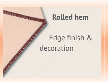
Rolled hem Edge finish & decoration