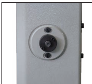
Idler for belt tension adjustment