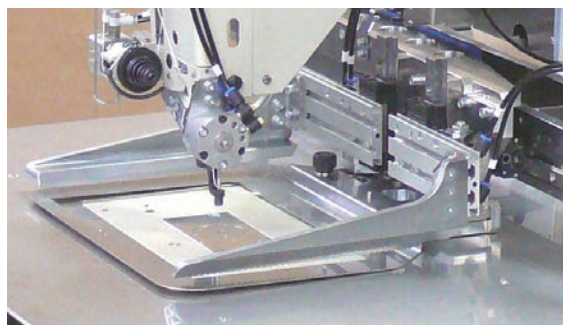
Reliable clamping system