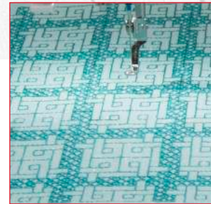
Built-in Sashiko and Wedding designs