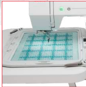
Maximum Embroidery Size: 7.9" x 14.2"