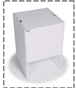
The 'Elements' Storage chest (Model 203)