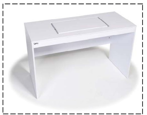
The 'Elements' Sewing table (Model 201)