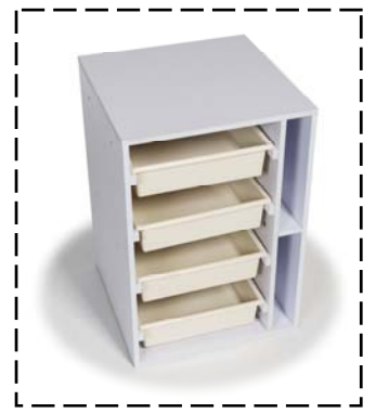
The 'Elements' Drawers (Model 202)